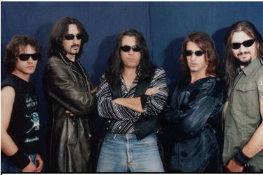
Tarchon Fist 2005