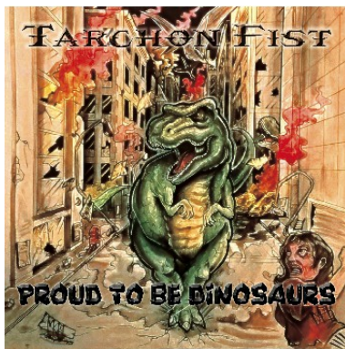
Proud To Be Dinosaurs

Unfortunately the intense activity obliged "Animal", the historical drummer, to leave the band. This was a bitter blow , not only to the four survivors of the Tarchon world front line, but also to the whole staff that suffered the abandonment of the musician so much that many tears were shed during the presentation of the "Celebration" videoclip when all were aware that a historical cycle was having its conclusion.