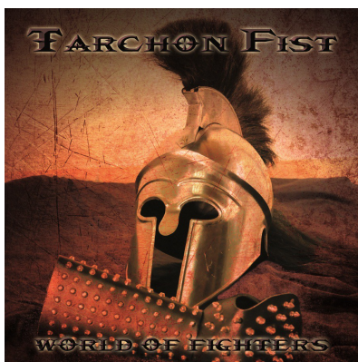
World Of Fighters LP

As usual Tarchon Fist went on working hard both in live and studio activities. At the end of 2011 Tarchon Fist realized that a renewal was necessary for the release of their new album starting right from their appearance. Hence the decision to recreate the band look in a military style, including the cd cover and all the gadgets.