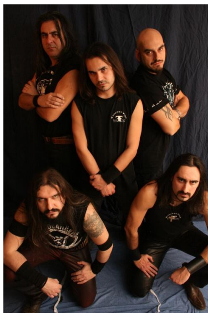
Tarchon Fist 2008