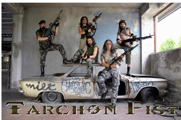
Tarchon Fist 2012

In 2012 the band, in addition to the work on the new album, went on performing on live stages: in France and particularly in Czech Republic Tarchon Fist got a great success. The purpose of Tarchon Fist was to bring Italian Metal around Europe in a short time . On October 1st the new cd “Heavy Metal Black Force” (My Graveyard Productions) finally came out. It is important to underline that on the 12 tracks there were all the 4 guitarists who had the opportunity to be part of Tarchon Fist! The album, called “Heavy Metal Black Force” was presented on October 4th in Bologna, on 5th in Brescia and on 12th in Padova where the band played without any supporting groups, with a totally unpublished bill. All the new lyrics and a