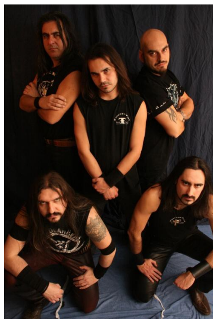
Tarchon Fist 2008