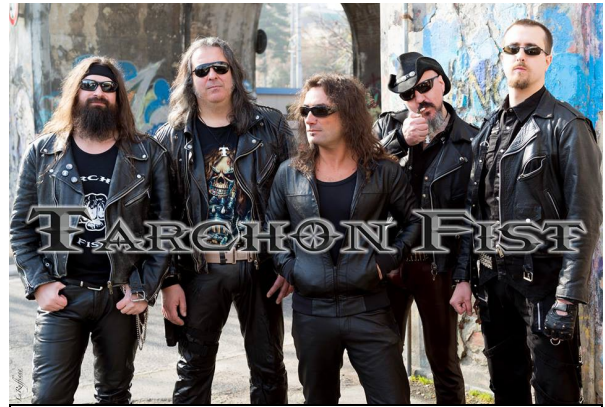
Tarchon Fist 2017