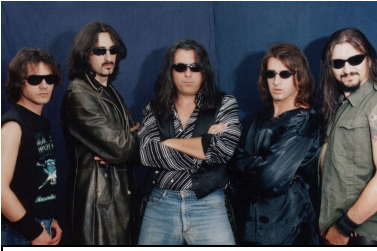
Tarchon Fist 2005