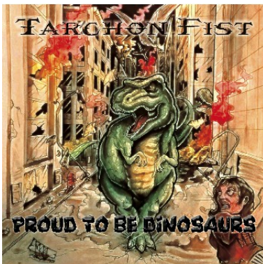
Proud To Be Dinosaurs

Unfortunately the intense activity obliged "Animal", the historical drummer, to leave the band. This was a bitter blow , not only to the four survivors of the Tarchon world front line, but also to the whole staff that suffered the abandonment of the musician so much that many tears were shed during the presentation of the "Celebration" videoclip when all were aware that a historical cycle was having its conclusion.