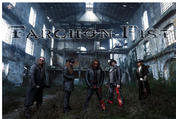
Tarchon Fist 2019

On April 2019 the recording of two new videoclips started: “My Destiny” and “Proud To Be Dinosaurs”.