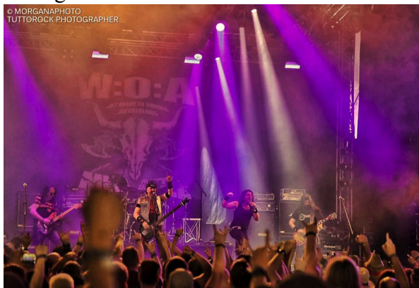
Tarchon Fist live at Wacken 2018

On March the 8 th 2019 Tarchon Fist announced by official online channels the upcoming release of the new concept album “Apocalypse” on August the 16 th under the german label “Pride & Joy”.