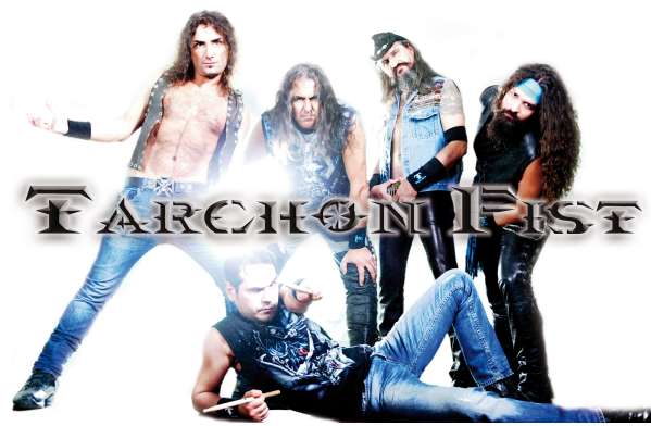
Tarchon Fist 2015

traditional European locations, played for the first time in Poland and Spain. In 2016 the historical German magazine "Rock Hard" published a compilation, enclosed to the magazine, including Opeth, Testament and other big bands, among which the Tarchon Fist.