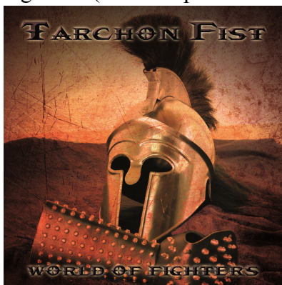
World Of Fighters LP

Figthers” (a title inspired to the first songs of side A “It’s my world” and side B “Fighters”).